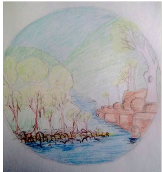
Design for satellite dish back drop