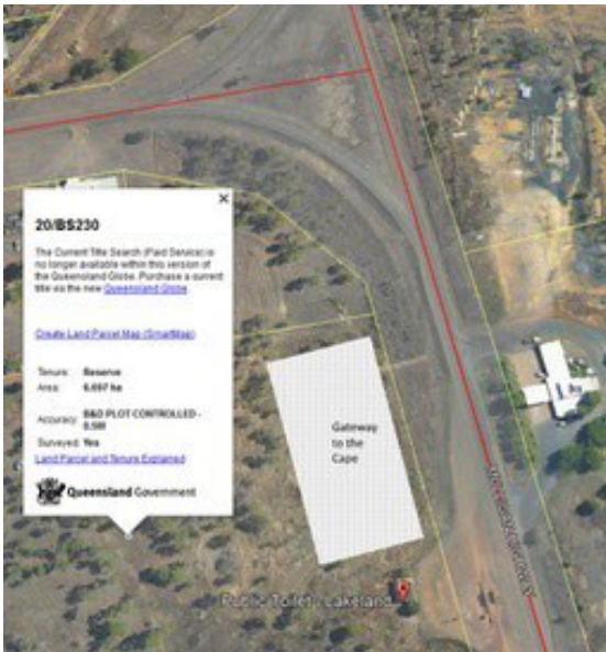
Site of Gateway to the Cape